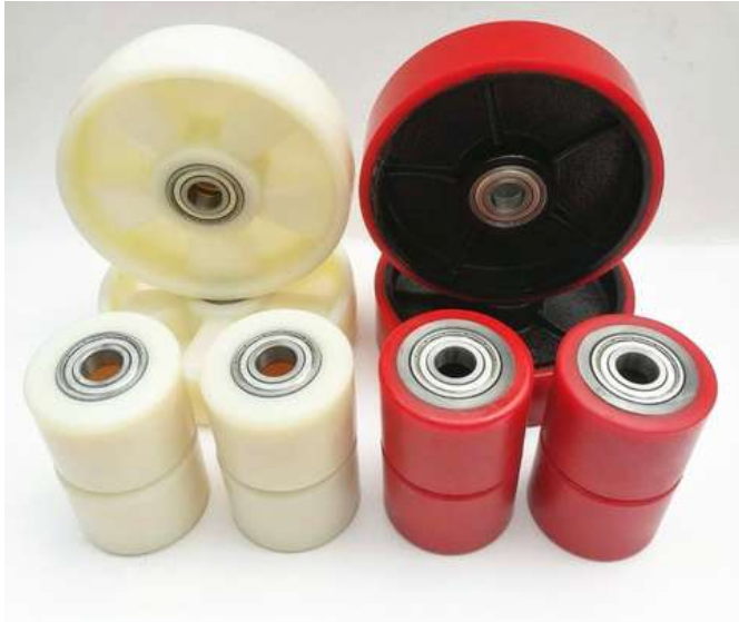
HPT NYLON/P U WHEEL