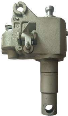
HAND PALLET TRUCK PUMP