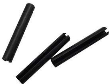
ELASTIC CYLINDER PIN