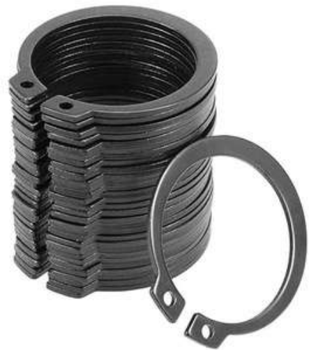
EXTERNAL CIR CLIP