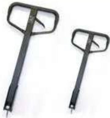
ARM HAND PALLET TRUCK