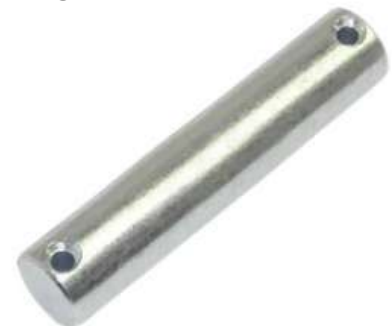
LOAD WHEEL SHAFT