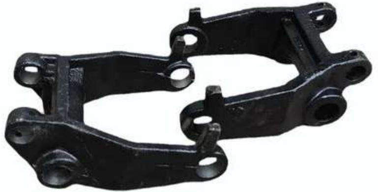
BRACKET LOAD WHEEL