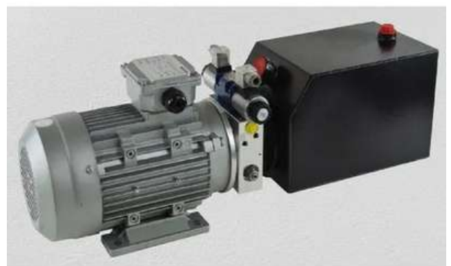
POWER PACK STACKER