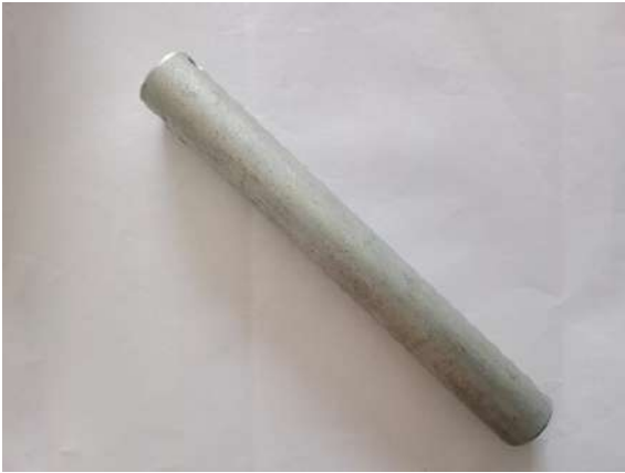
FRAME CONNECTING SHAFT