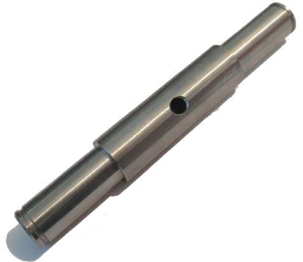
AXLE STAINLESS STEEL