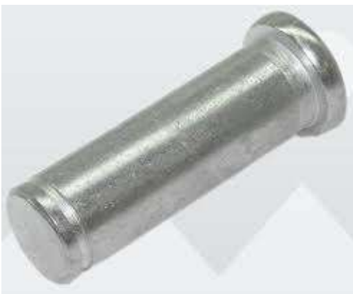
ARM MOUNTING PIN